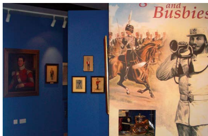
Bugles and Busbies